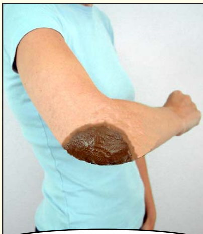
Medi-Body Pack applied to elbow

“In my opinion, the main reason the magnificent body detox therapies of the past using clay and moor mud are so little used today is the lack of therapeutic-grade ingredients (i.e. some clays are even toxic).